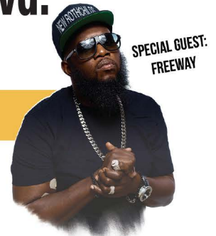
SPECIAL GUEST: FREEWAY

Fun free family day of activities, including bike rides, face painting and boating along the river.